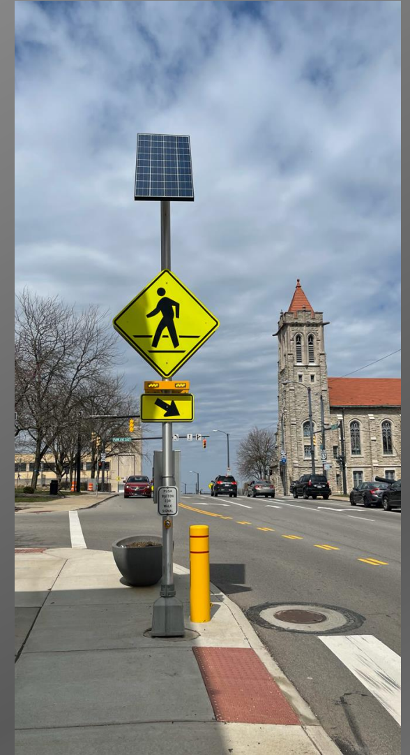
Rapid Flashing Beacon