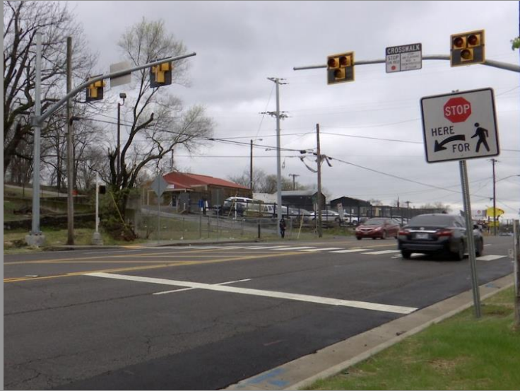
Overhead pedestrian signal