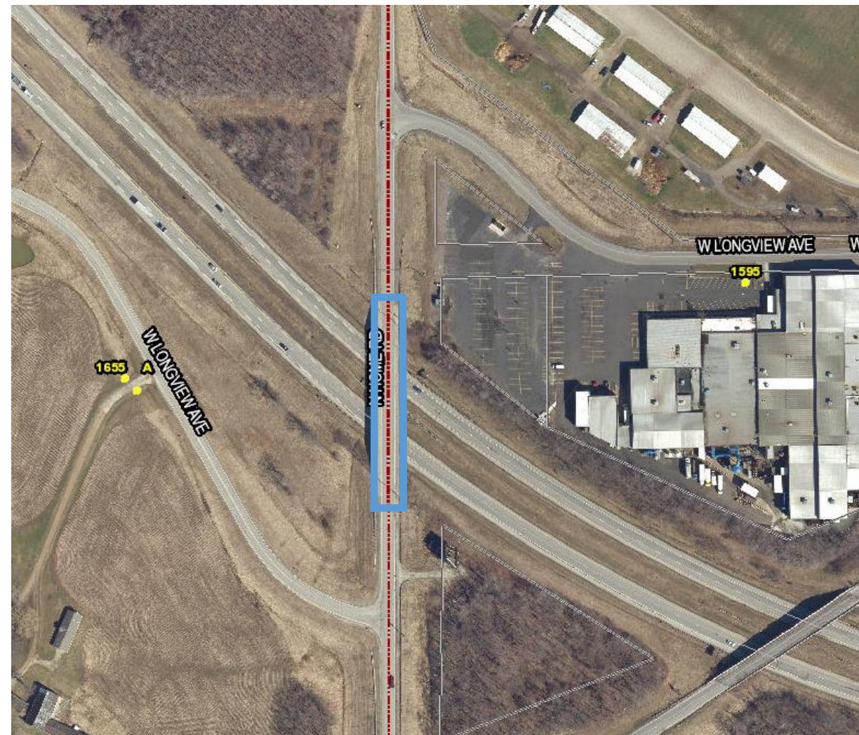
Bill #20-266 — Bridge Rehab ($0 Local Funds; 2025 Construction)